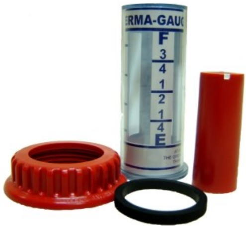
H Repair Kit